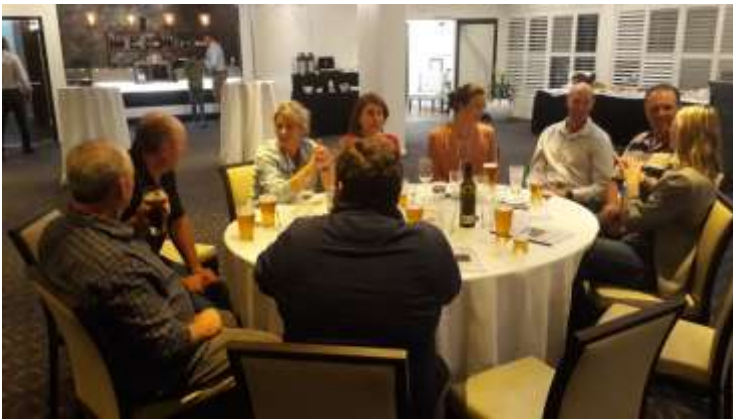
Presentation Last Year