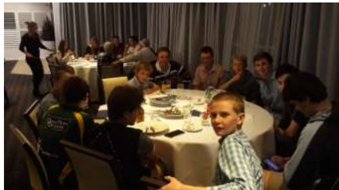
3rd Grade Table at 2018-19 Presentation