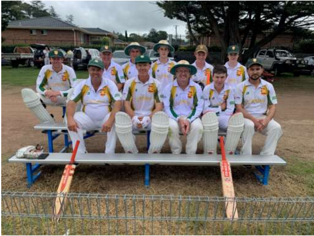
2 nd Grade 2019-20