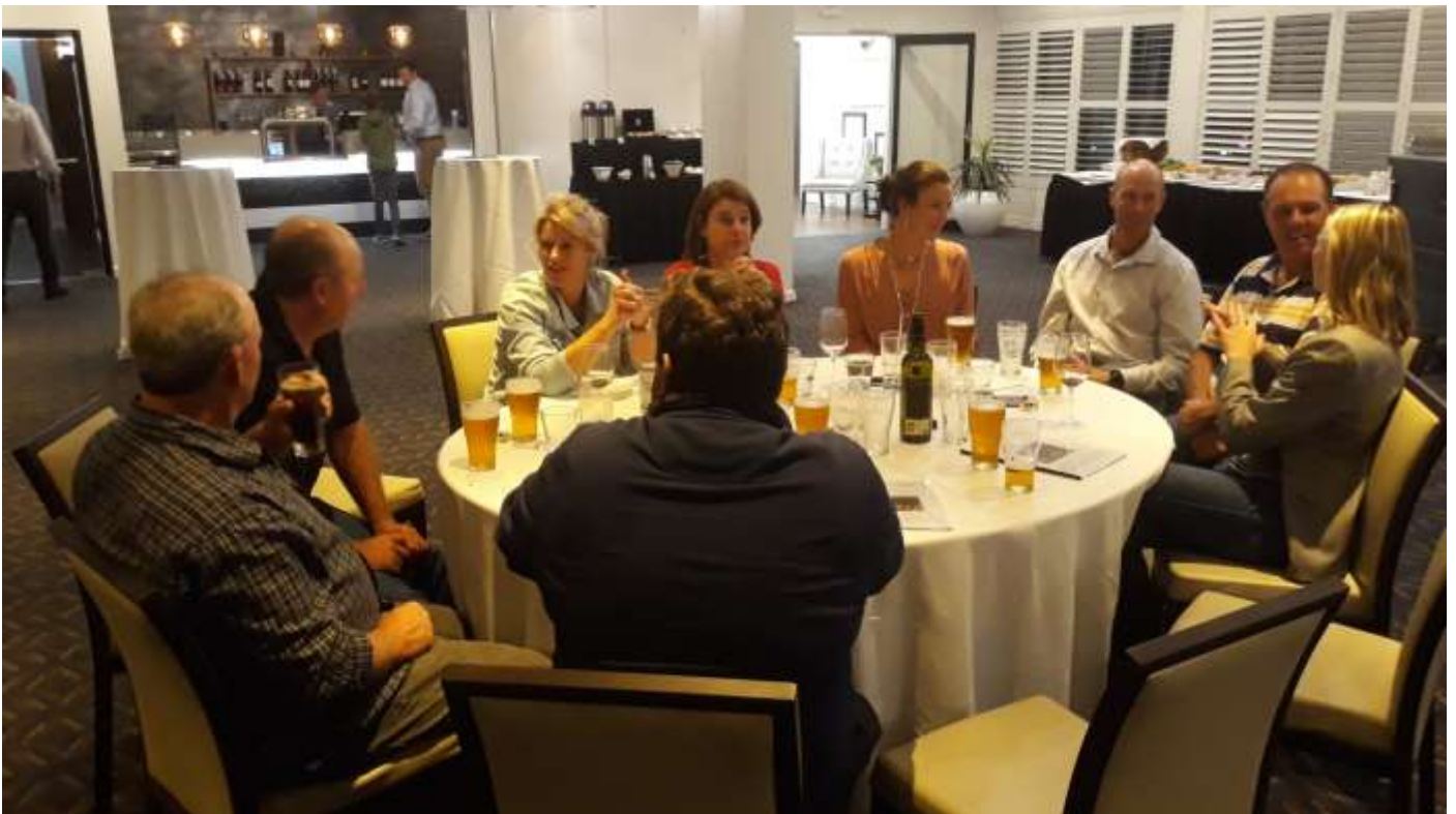
3rd Grade Table at 2018-19 Presentation