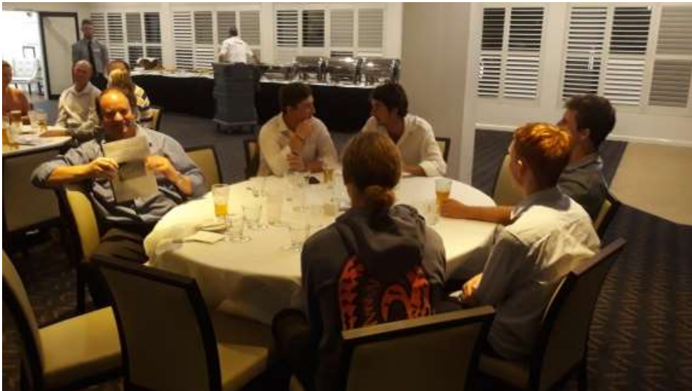
HCCC Presentation Last Year