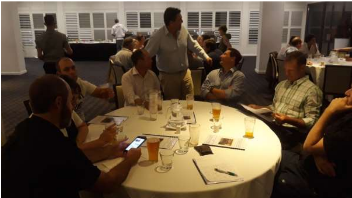
2 nd Grade Table at 2018-19 Presentation