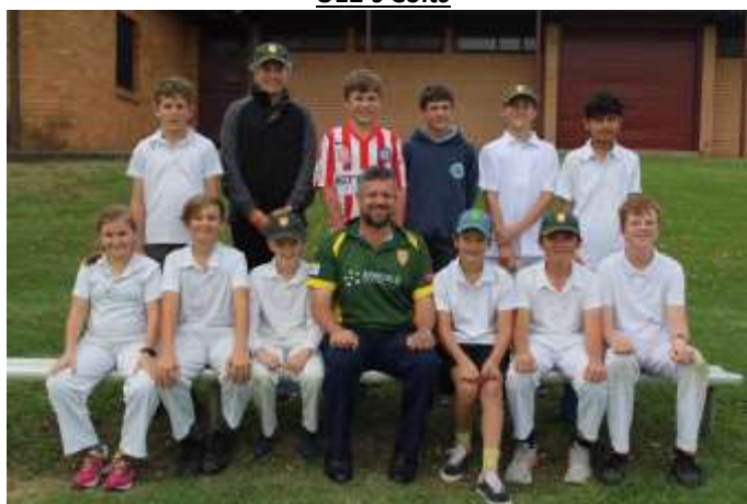
U-12 Hillgrove Champions 2019/20 season

I want to give a big shout out to this wonderful team of kids.