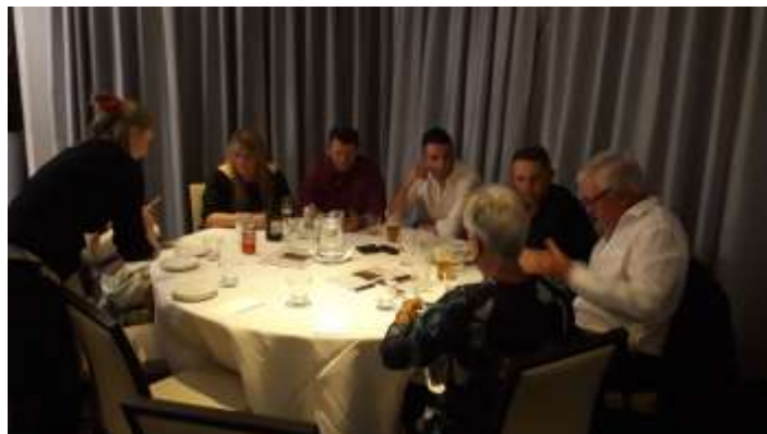
Presentation Last Year